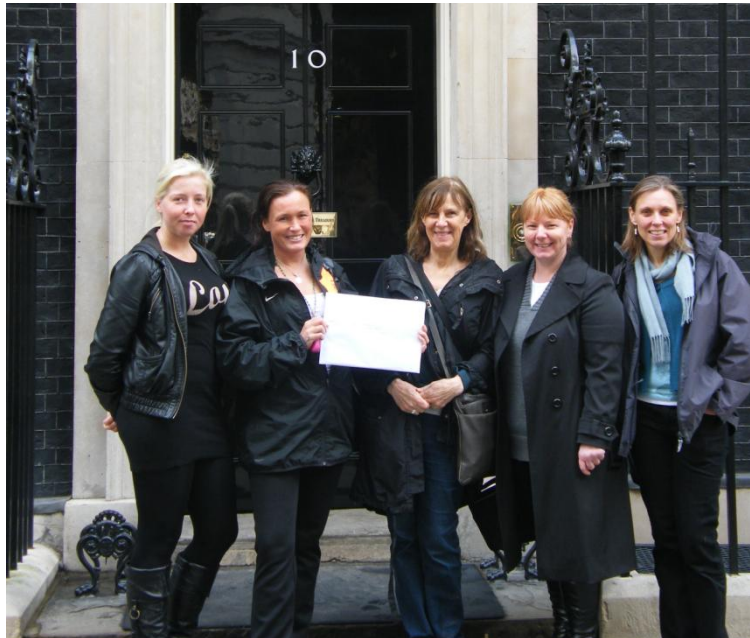
Security of Tenure Petition being delivered to Downing Street

The summary way in which Regional Plans were abolished, throwing planning processes in disarray, has been the subject of a scrutiny exercise by the parliamentary select committee on community and local government: and to a successful judicial review taken out by a building developer and the Community Law Partnership (who represent Travellers). LGTU, along with other Traveller organisations have made a submission on the impact on site provision to the Select committee.